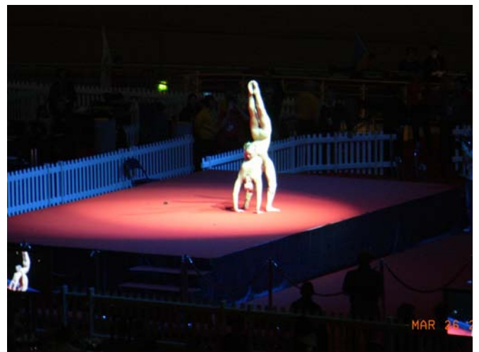
Part of the opening ceremony involved a gymnastic display by a number of skinsuit-clad young ladies. I will say no more than they were extremely agile, fit and strong. Judge for yourself from the picture.